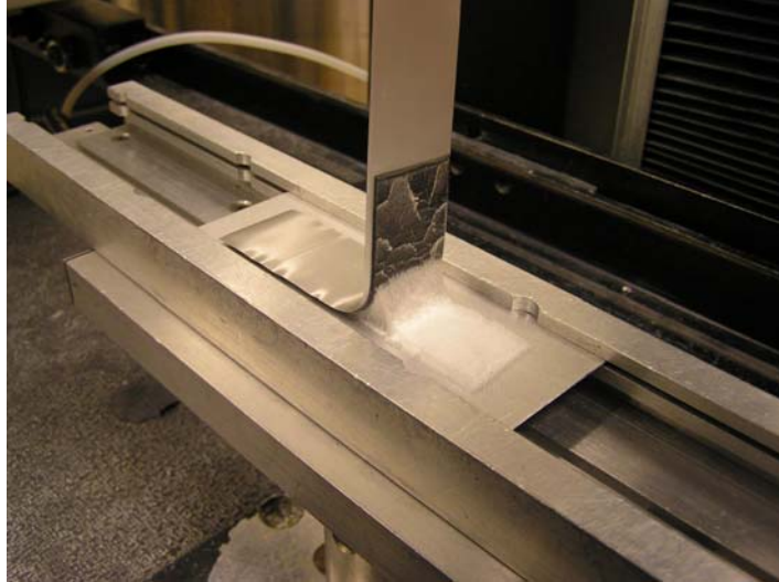
Ninety degree peel adhesion testing showing “adhesive split” of 4412N tape. (Black area is 5925 tape bonding the aluminum foil peel strip to non-adhesive, ionomer film side of 4412N.)