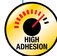
Sharp lines and 3-day clean removal.